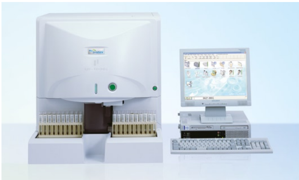
Fig. 4 UF analyser with IPU by means of which the UF-series analysers are controlled almost exclusively

Hardware and software as well as the reagent system implemented in the UF-1000i and UF-500i are brilliant in their easy handling and operation. Their attractive design and the truly convincing and appealing software of the IPU (information-processing unit) will enable fast familiarisation with the operation of the UF-series analysers which render modern urinalysis clearly more attractive (Figure 4).