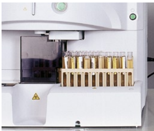
Fig. 1 Placing the sample tubes on the sampler of the UF analyser

Without any further preparations to be made, the tubes with the native urine can be placed on the sampler of the UF-1000i or UF-500i analyser directly after having opened them. The urine sample will be automatically mixed, and a volume of 1,200 \mu\text{L} will be aspirated for analysis (Figure 1).